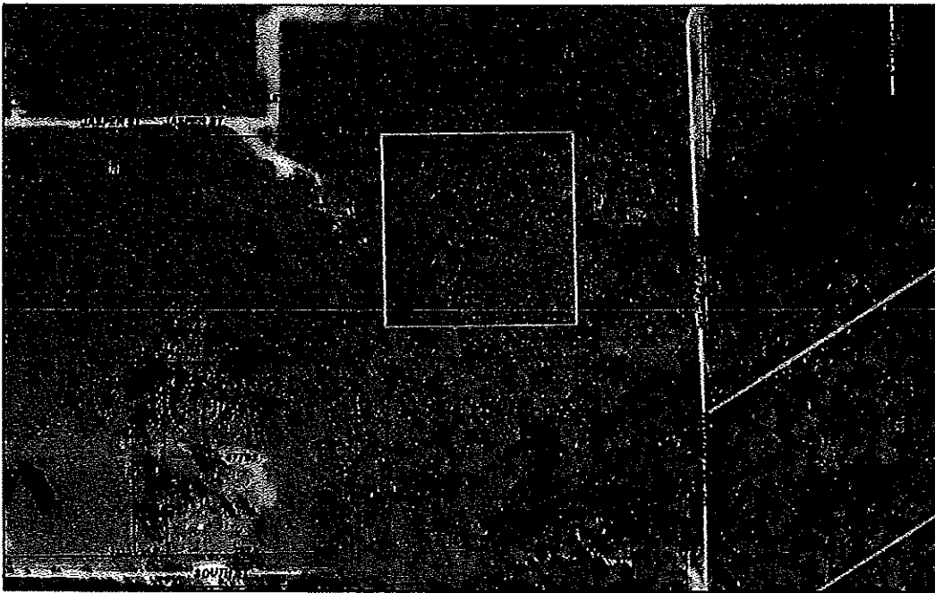
Bastrop CAD Web Map