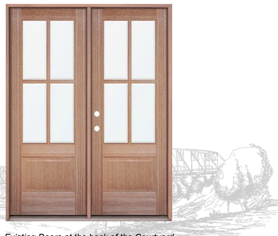
Existing Doors at the back of the Courtyard