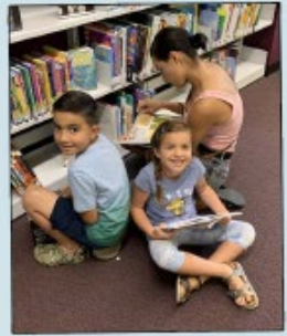
Picking out books