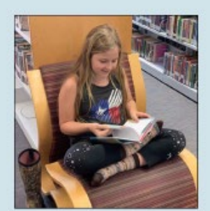
Enjoying a book