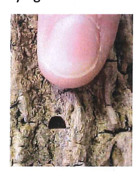
D-shaped exit hole