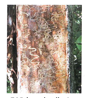
EAB larval galleries

Guide for communities: <a href="http://tfsweb.tamu.edu/eab/">http://tfsweb.tamu.edu/eab/</a> Hotline to Report: 1-866-322-4512