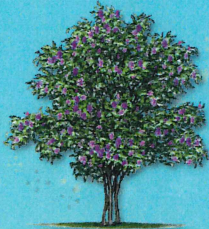
Texas Mountain Laurel