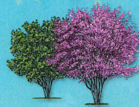
Texas or Mexican Redbud