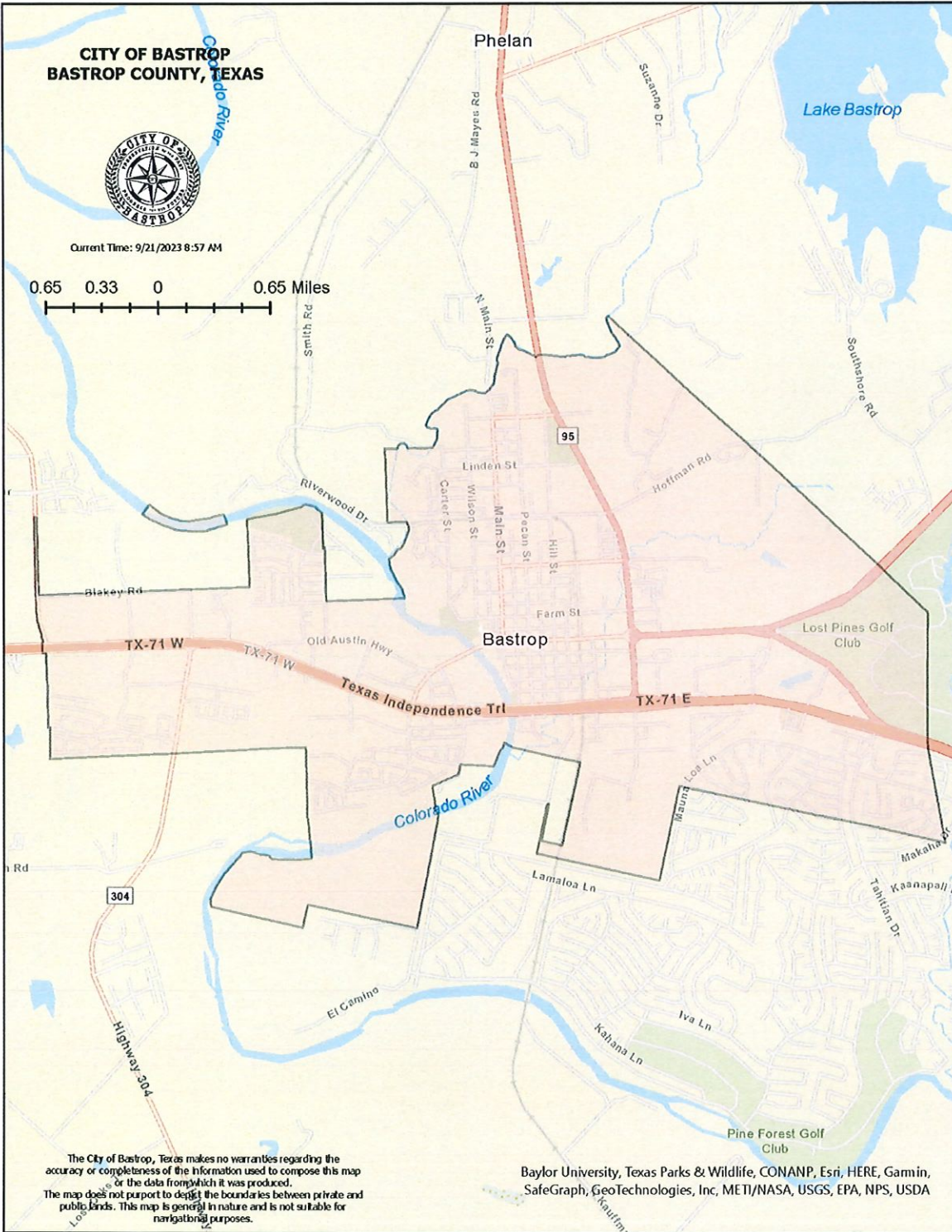
EXHIBIT A AREA FOR AUTOMATIC RESPONSE BY THE CITY OF BASTROP

City of Bastrop Agreement for Automatic Aid Assistance ESD 2