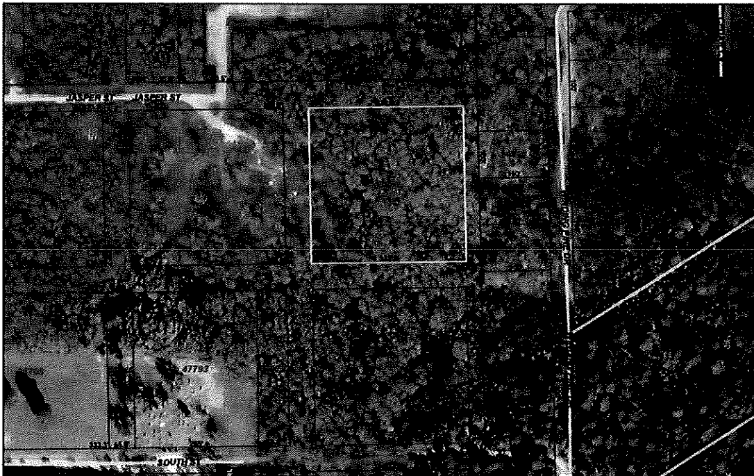
Bastrop CAD Web Map