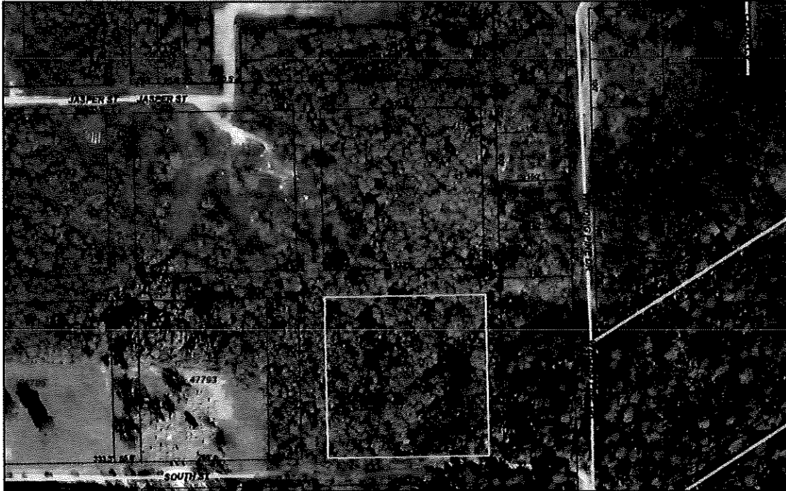
Bastrop CAD Web Map