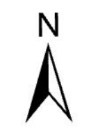
Exhibit 1.1 Transportation Service Areas